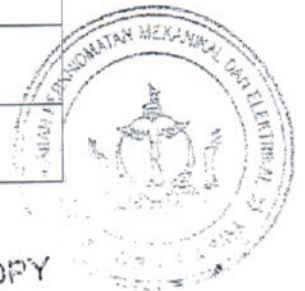
ABB PTE. LTD.